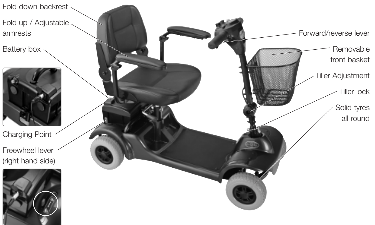
Photo shows Eco 4 model scooter. The Eco 3 is a 3 wheel version. See the specification for differences.