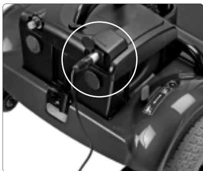
Battery Charging Socket